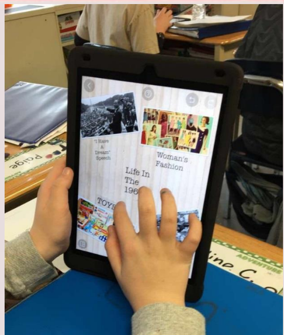
5 th Graders using Pic Collage while learning about the 1960's!