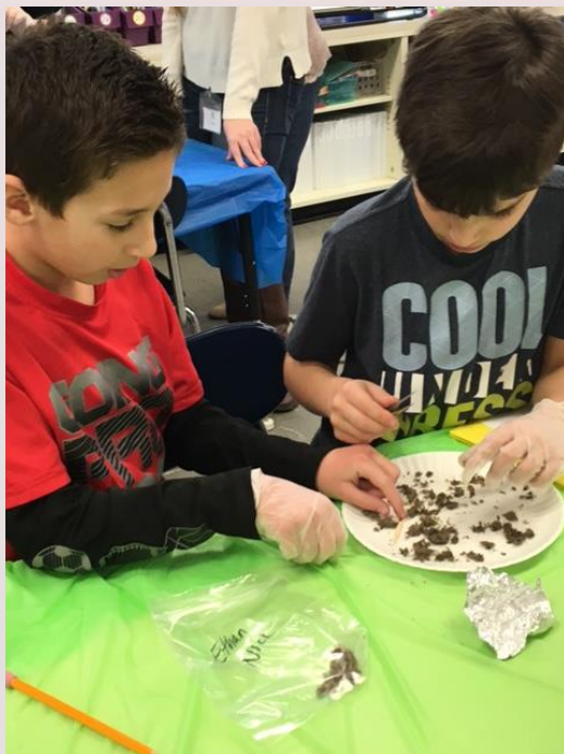
4 th Grade Owl Pellet Dissection!