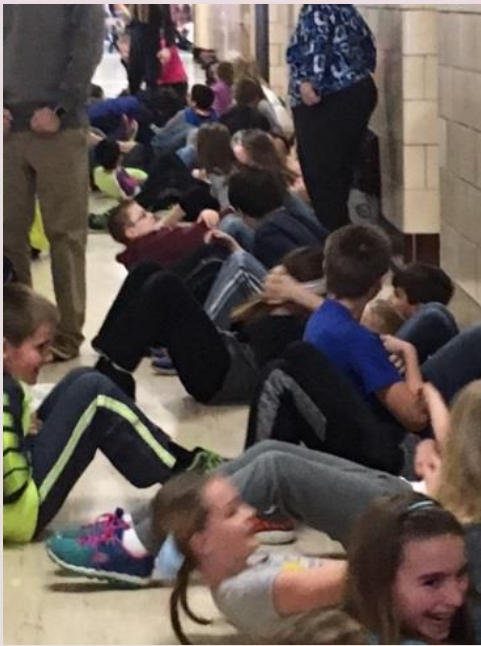
100 Day Fun- As a school we did 100 exercises all at the same time!