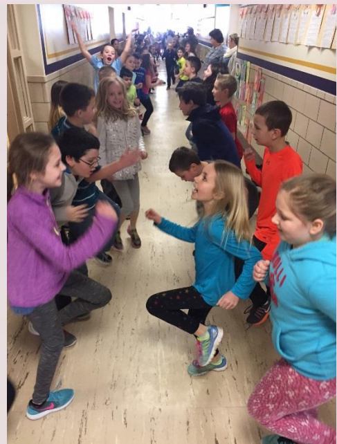
More 100 Day fun!